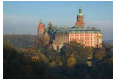
2. It's an old c _____.