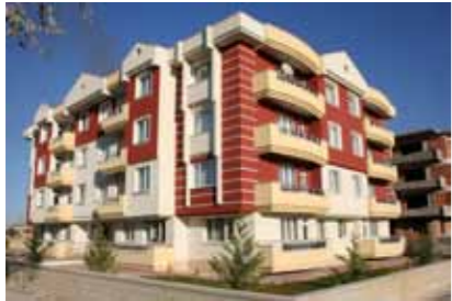
1. It's a b _____ of f _____.

Buildings. Fill in the gaps under the pictures.