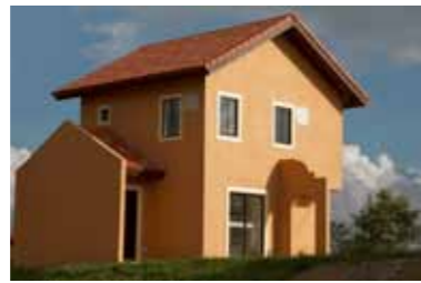
5. It's a d _____ house.