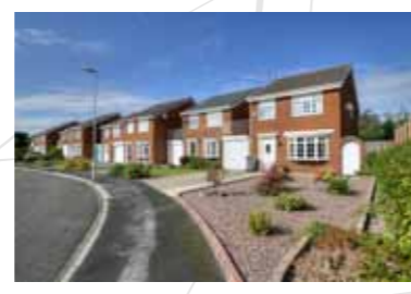
12. These are t _____ houses.