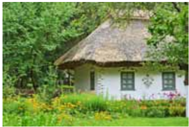
4. It's a country c _____.