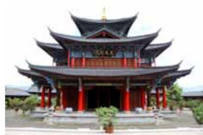
3. It's a Chinese p _____.