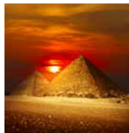
10. These are p _____.