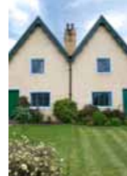
6. It's a s _____ - d _____ house.