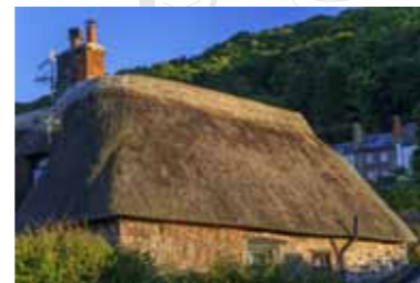
9. The roof of this t _____ house is covered with s _____.