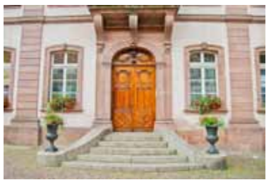
7. It's a r _____.