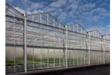
8. It's a g _____.