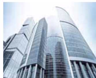
11. It's a s _____.